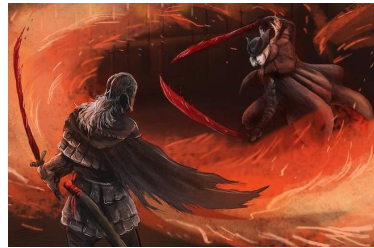
(a) <USER> Hurricane Lady #Maria It'll rain burning blood. I hope Puerto Rico knows how to do Visceral Attacks. Unimodal: informative (X) Multimodal: not-informative (✓)

or donation effort” (denoted as “R”) whereas the predicted label is “not-humanitarian” (i.e., the value of the cell at the intersection of row “R” and column “N”). Specifically, the image-only model has 43 false negative instances in Table 5(b) while the text-only and multimodal models have 37 and 33 instances in Tables 5(a) and 5(c), respectively. In general, we see that the number of such errors are minimized by the third model which uses both text and image modalities together. However, there are still some cases where significant improvements can be achieved. For instance, the “other relevant information” category (denoted as “O”) seems to create confusion for all the models, which needs to be investigated in a more detailed study.