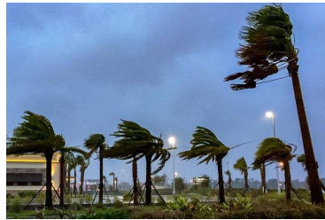
(b) Hurricane Irma: Rapid response team 'rescues' fine wines - https://t.co/pUEeOixSdc #finewine #HurricaneIrma Unimodal: not-informative (X) Multimodal: informative (✓)