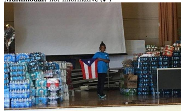
(d) 6th grade Maryland student collects 3,000 cases of drinking water for Puerto Rico https://t.co/x57AeLHeaC Text-only: not-humanitarian (X) Image-only: not-humanitarian (X) Multimodal: rescue, volunteering or donation effort (✓)