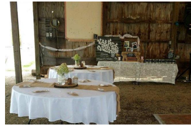
(c) RT <USER> Hurricane Irma nearly ruins a wedding day here in northeast Ohio! Social meeting comes to the rescue Unimodal: informative (X) Multimodal: not-informative (✓)