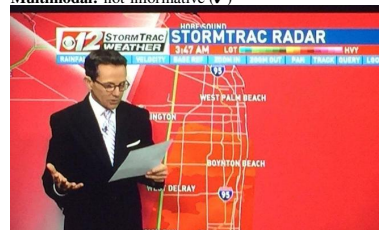
(f) #Breaking Tornado warning for Lantana Rd south to Boca Raton. #BeSafe <USER> Text-only: not-humanitarian (X) Image-only: not-humanitarian (X) Multimodal: other relevant information (✓)