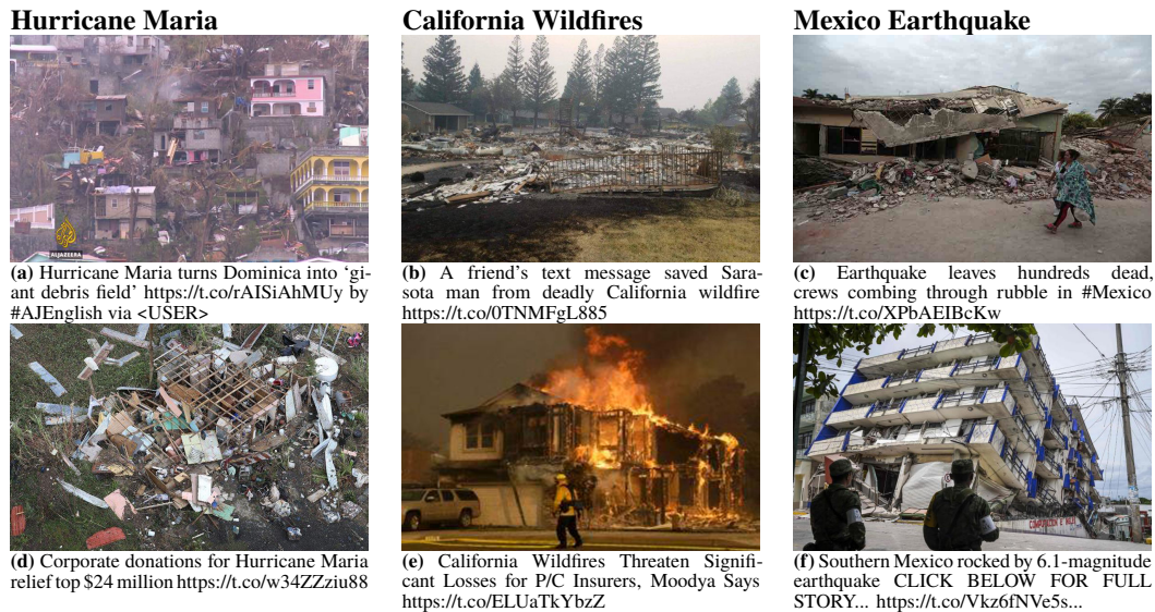
Figure 1. Tweet text and image pairs from different disaster events with complementary information.

Most of the previous studies that rely on social media for disaster response have mainly focused on textual content analysis, and little focus has been given to images shared on social media (Imran et al. 2015; Castillo et al. 2016). Many past research works have demonstrated that images shared on social media during a disaster event can help humanitarian organizations in a number of ways. For example, Nguyen, Ofli, et al. 2017 use images shared on Twitter to assess the severity of infrastructure damage. Mouzannar et al. 2018 also focus on identifying damages in infrastructure and environmental elements. Taking a step further, Gautam et al. 2019 have recently presented a work on multimodal analysis of crisis-related social media data for identifying informative tweet text and image pairs.