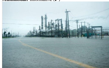
(e) Hurricane Harvey's impact on the US oil industry https://t.co/zzVVR3u0fU Text-only: other relevant information (X) Image-only: not-humanitarian (X) Multimodal: infrastructure and utility damage (✓)